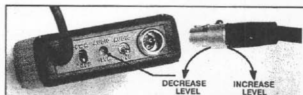
Figure 5 - Adjust Transmitter Audio Level Control